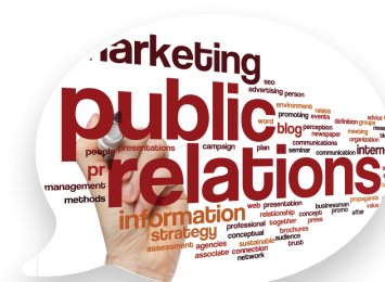
PR and Communication