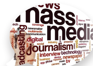
Mass Media Advertisement